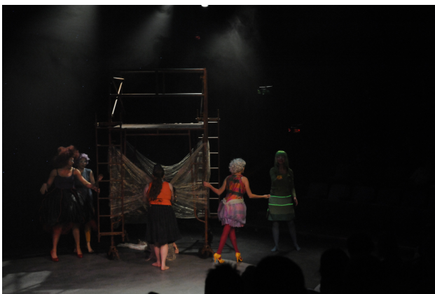
Fig. 2 As Titania is cocooned, five human fairies interact with four micro-helis. The two most salient are visible above the actors on the right. The third is in the hand of the green fairy, who is relaunching it. The fourth robot is flying above the scaffolding.

The intention in this scene was for the micro-helis to complement the enchanted world that Shakespeare created. They hovered above the action and when near a human fairy, that actor would interact with it, establishing what some identified as a mother-baby relationship. The actors learned to interact with the micro-helis in a very convincing manner, improvising petting or cooing to the micro-helis as they landed, or scolding a micro-heli that crashed or was being difficult to catch. By the end of this scene, the relationship between human and baby fairy was crystallized.