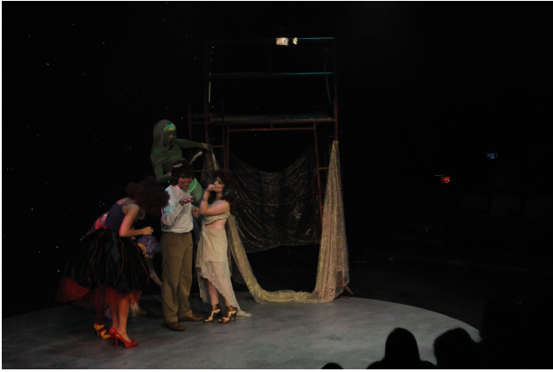
Fig. 4 In the same scene, Mustardseed stoops to pick up and relaunch a crashed micro-heli fairy.