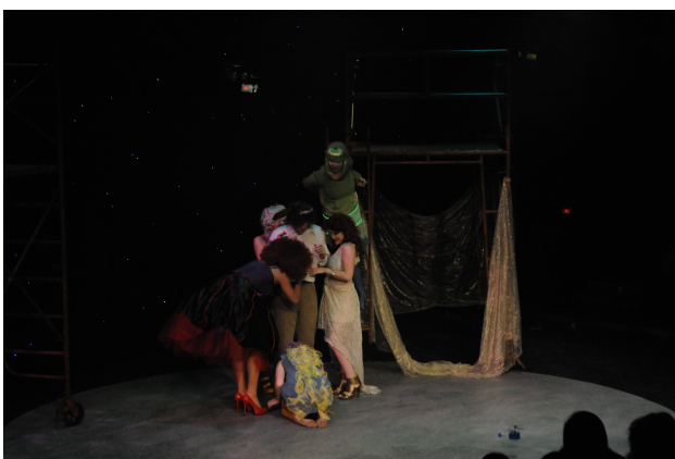
Fig. 3 Four human fairies and five micro-heli fairies are introduced to Bottom by Titania. The two near stage back and right are close to mid-air collision.