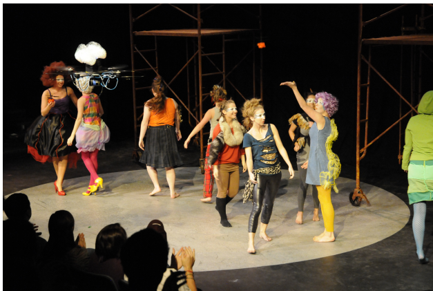
Fig. 6 The robots are flown or carried onto stage at the beginning of the curtain call, as the human fairies take their bow.