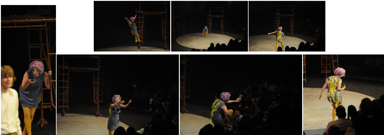
Fig. 5 Mustardseed launches her micro-heli fairy and together they mock Bottom. In ending the scene, the micro-heli flies over the audience. Mustardseed improvises by clamouring over the audience and casting them with a look of scorn for stealing her baby fairy, much to their amusement.